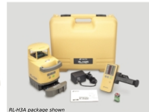
RL-H3A package shown